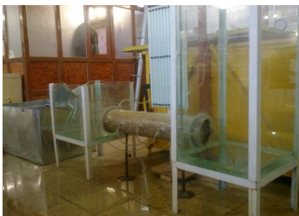
Figure 1: General view of the experimental set-up used in this study

Packed column test components consisted of 5 whole parts including upstream tank, downstream tank, packed bed; piezometric board and measurement chamber of the flow rate (see Figure 1). The dimensions of upstream tank are 1 m × 0.50 m × 0.50 m and are made of glass which was placed inside a metal frame and also the dimensions of downstream tank are 0.50 m × 0.50 cm × 0.50 cm. The internal diameter of cylinder containing materials is 0.20 m and its length is 1 m. The packed bed was filled with selected granular materials and uniformly compacted. The packed column was then connected to two water tanks of adjustable levels at each end. By adjusting water levels in the upper tank, various flow rates and hydraulic gradients were established. Measurements were carried out after a steady state of flow was reached; in total 6 hours time was spent for each experiments (reading piezometric board and measuring seepage discharge). Scaled piezometric board was composed of 10 clear tubes tabs. Due to large grain sizes and voids, air bubbles exit through piezometers and water level in piezometers became stable after a short time. Finally, volumetric seepage discharge and piezometric pressures were measured at different time intervals and averaged for subsequent analyses (Figure 2).